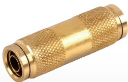
STRAIGHT UNION DOT UNION RECTA DOT