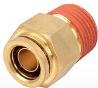
MACHO RECTO DOT STRAIGHT MALE DOT